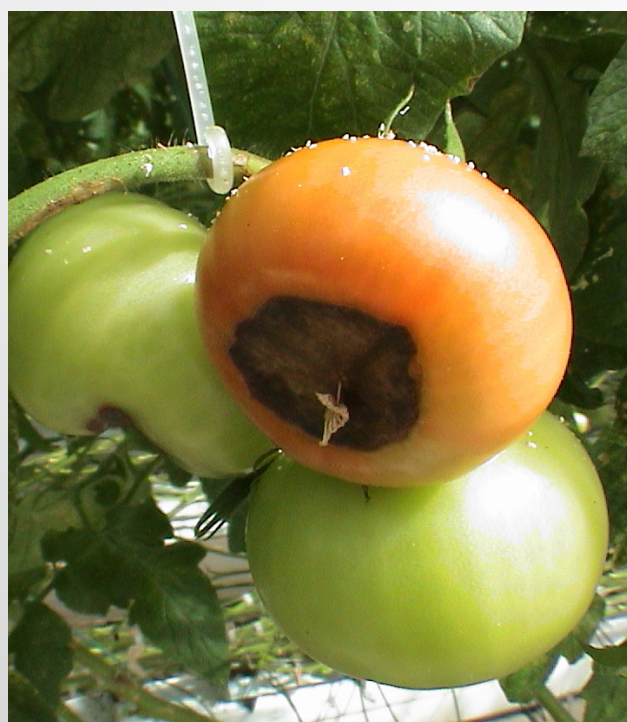
BLOSSOM END ROT OF TOMATO

Calcium-deficient leaves show necrosis at the leaf base. Due to the very low mobility of Calcium, symptoms first appear on the younger leaves. Classic signs of Calcium deficiency include burning of the top of tomato fruits, tip burn of lettuce, blackheart of celery and the decease of the growing regions in many plants. Soft necrotic tissue in rapidly growing areas is common. This is generally related to poor translocation of Calcium rather than to a low external supply of Calcium. Slow growing plants suffering from Calcium deficiency may re-locate Calcium from older leaves to younger ones in order to maintain growth. Consequently, the margins of the leaves will develop more slowly than the inside causing the leaf to cup downward. Finally, petioles will develop but without leaves. Plants suffering from chronic Calcium deficiency have a much greater tendency to wilt than non-affected plants.